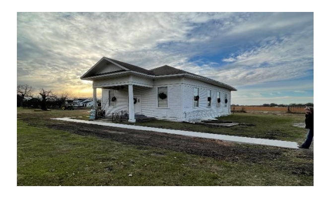
Special thanks to HR Dirt Works for installing the new sidewalks at the Camp Ground Church seen here.