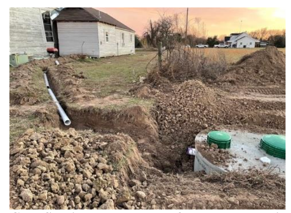
CBD Septic donated labor for the new septic installation seen above. The funds raised by the town flea market last spring paid for much of the 500-gallon aerobic system.